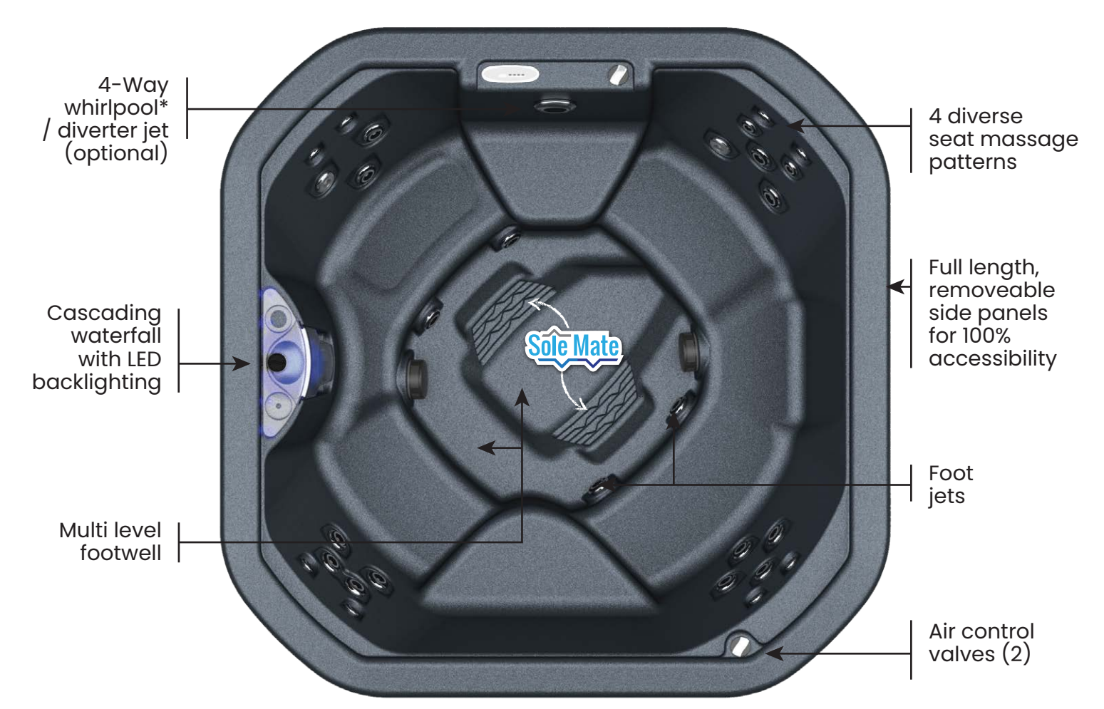
Image for reference only. Colors, specifications and location of the whirlpool* jet may vary (optional).